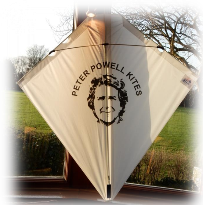
Peter Powell Kite displayed with great pride at Pete's Awake....

Peter Trevor Powell (c. 1932 – 3 January 2016) was a kite maker who developed a steerable kite in 1972, using dual lines. Very early on, Powell's kites had spars made of ramin ( Gonystylus ) which were later replaced with aluminium tubing and, later still, by glass fibre spars. Originally they all came with black plastic sails, though later blue, red and yellow sails became available. The kites came with a long, hollow polyethylene tail that was inflated by the wind. The tail added stability as well as looking good when performing stunts. He was born in Gloucester .