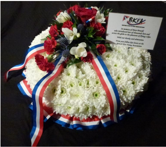
Wreath sent by British Kite Flying Association